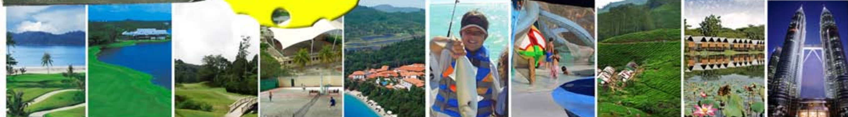
DAMAI LAUT GCC

For reservation, call Clearwater Sanctuary Batu Gajah Perak MALAYSIA on 605 366 7433 www.cwsgolf.com.my